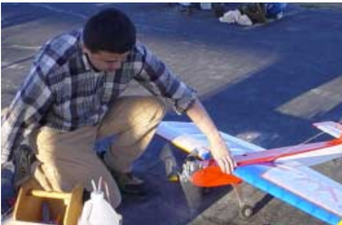
Another flight soaking up the February sunshine